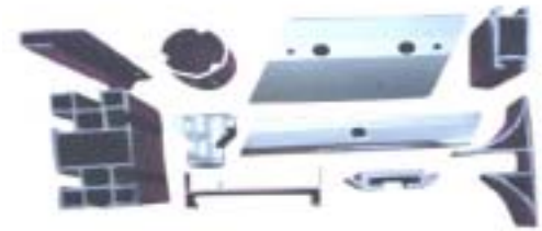
Aluminum Extrusion parts01