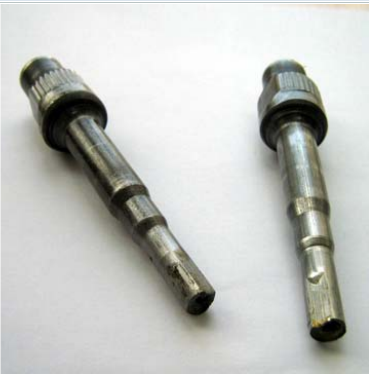
Hot Forging part