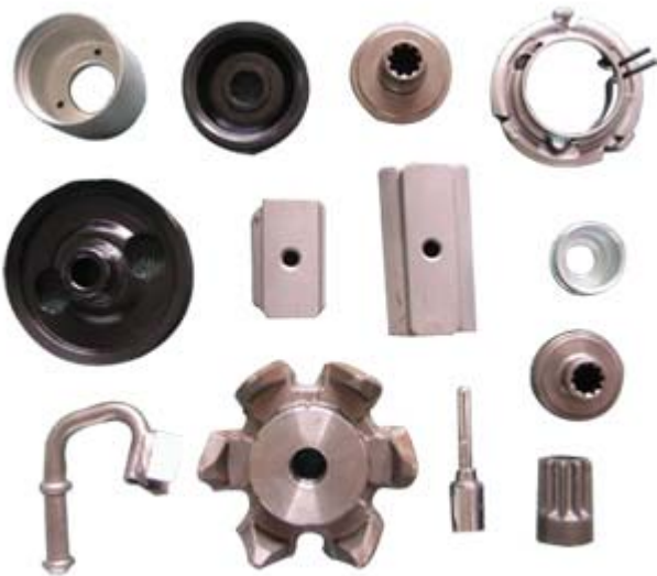
hot forgeing part-03