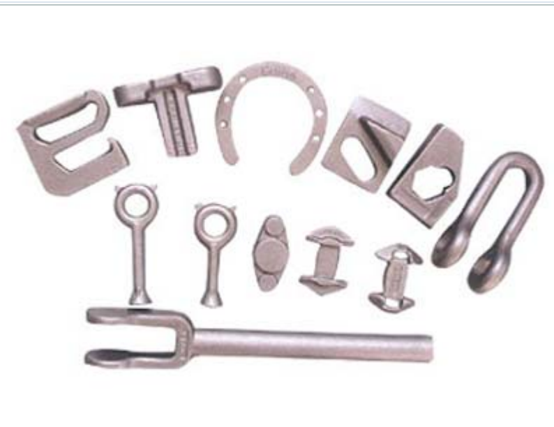
hot forgeing part-01