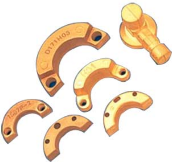
hot forgeing part-02