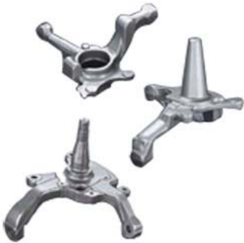
hot forgeing part-04