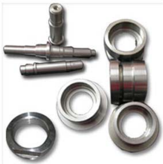
aluminum profile machining part

Industrial spare parts description: As an Industrial Spare Parts supplier, Ningbo Zhenhai Xinxie Machinery Co., Ltd offers a world class and affordable range of tools and apparatus that support the core operations of the production process. Such kinds of industrial parts serve the following communities: CNC / Metalworking Facilities Injection Molding Servicers HMI (Human Machine Interface) and PLC System Repair Industrial Automation Maintenance Printing Press Operators