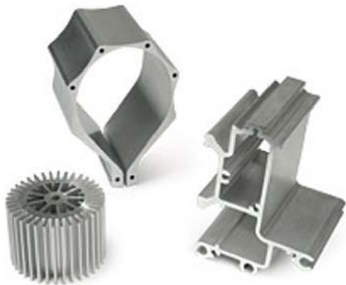
aluminum extrusion part2