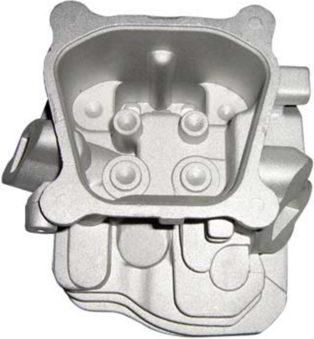
Precision Investment casting machining parts