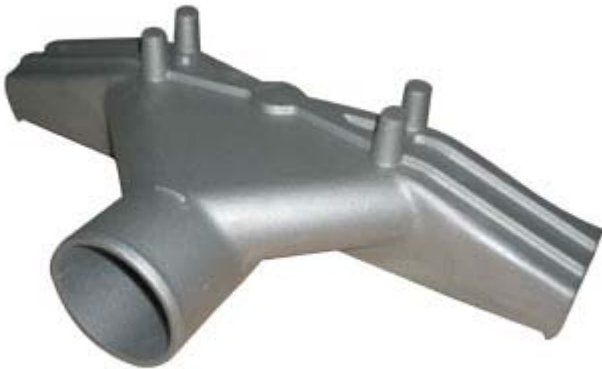
Investment casting machining parts-02