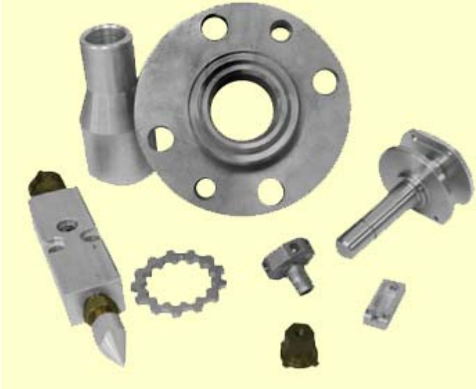
aluminum investment casting part bronze investment casting part