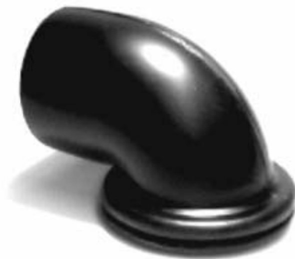
carbon steel investment casting part stainless steel investment casting part