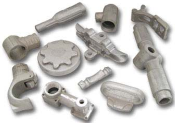
Investment casting machining parts-pro