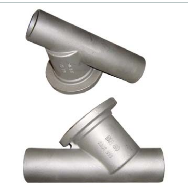
Investment casting machining