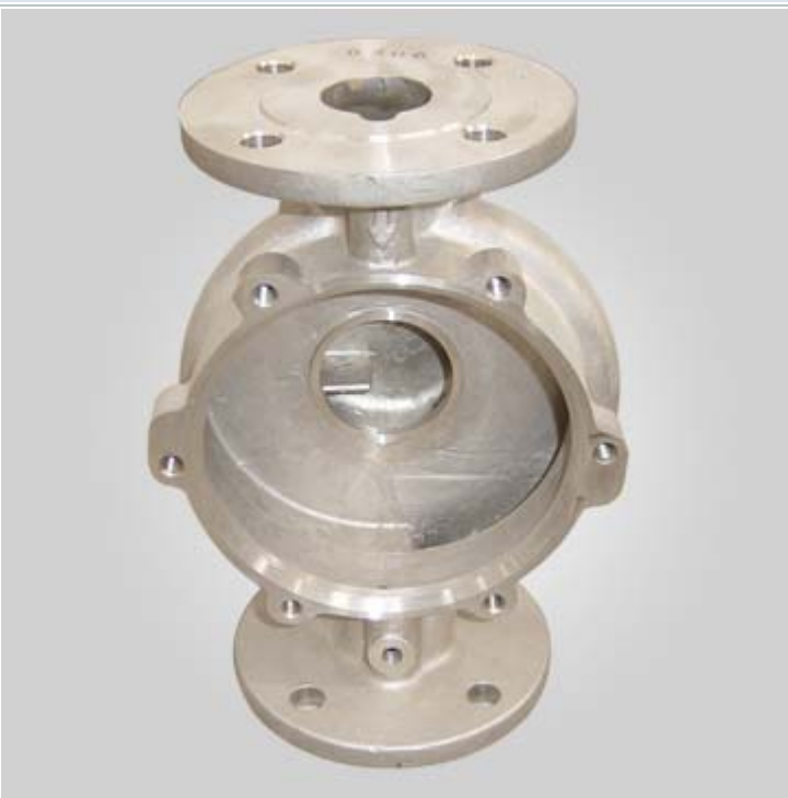
Precision Investment casting machining part