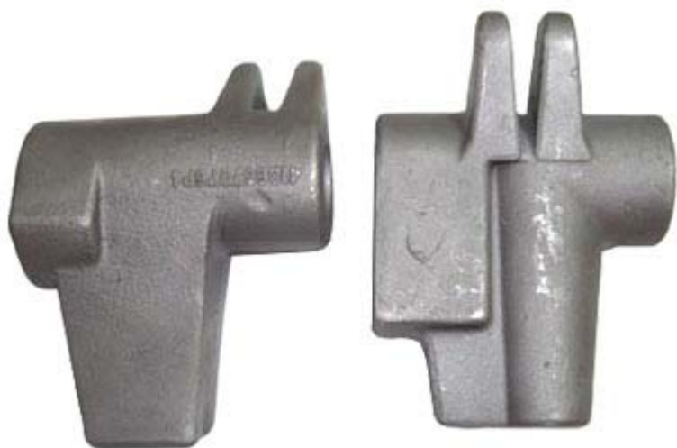
Investment casting machining parts-01