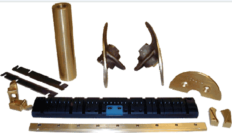
Precision Plastic machine part

Plastic machine parts description: Detailed Product Description our plastic injection partners own nearly 60 sets of machines for plastic injection which can produce the parts from 100g to 5000g, with materials of nylon, PC, PVC and ABS etc.