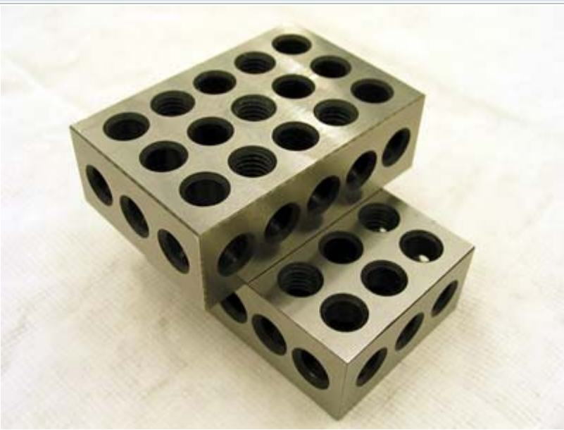
precision machining parts