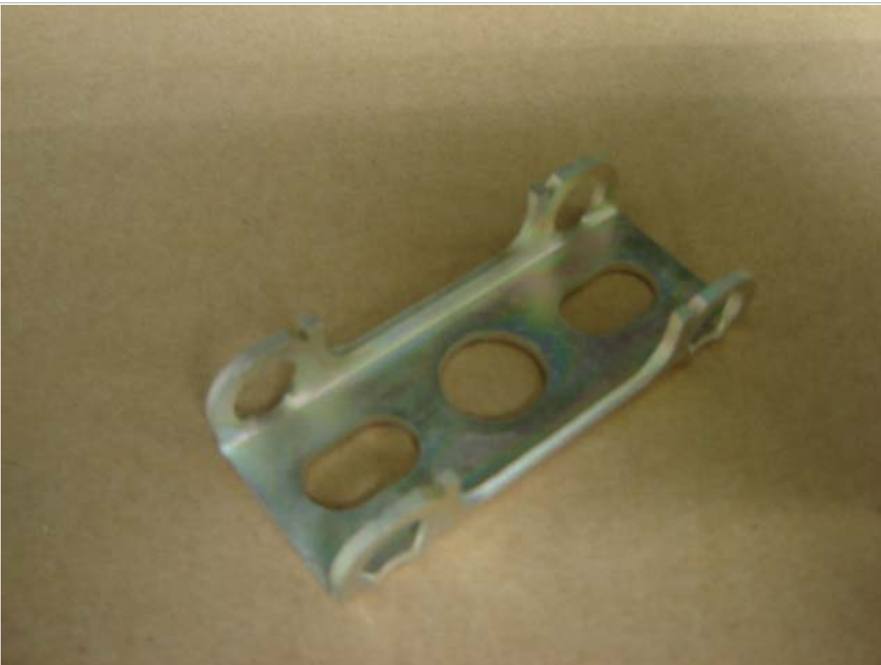
Sheet metal stamping

Mostly the materials available for stamping process are sheet metals like sheet steel, sheet iron, sheet aluminum and etc. Ningbo Xinxie Machinery Co.,Ltd, has introduced into high precision stamping machines. We specialize in difficult, complex custom metal stampings . We will review your application and look for an achievable solution. Our engineering group has developed and designed solutions that have proven that dedication and innovation will ultimately conquer any task at hand. We have succeeded where others wouldn't even try. Challenge us. Contact us today