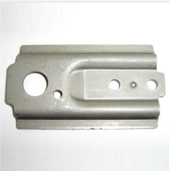
Precision Sheet metal stamping parts

Machine parts , china sewing machine parts , machine spare parts , Precision machining , Precision grinding , Micro machining , Industrial spare parts , Industrial equipment , Industrial products , Engineering machine parts , Cnc engineering , Mechanical engineering , Marine metal parts , Marine engine parts , Marine hull parts , Construction metal parts , Residential construction metal parts , Roofing metal parts , Precision machine parts , Precision machined parts , Precision metal parts , Printing machine parts , Printing equipment parts , Digital printing machines parts , Embroidery machine parts , Commercial embroidery machine parts , Computerized embroidery machine parts , All different machine parts , all different machine part , Sewing machine parts , industrial sewing parts , sewing needle parts , Plastic machine parts , Textile machine parts , Textile equipment parts , Knitting machine parts , Mill machine parts , Cnc mill parts , Cutting machine parts , Metal cutting parts , Cutting equipment parts , CNC machine parts , Cnc lathe parts , Custom machine parts , Custom machines parts , Transmission components parts , Screw Machine Parts , Screw machine products parts , Casting parts , die casting parts , Sand casting machining parts , sand casting proces , Gravity casting machining parts , Metal casting parts , Pressure die casting part , Investment casting machining parts , Investment